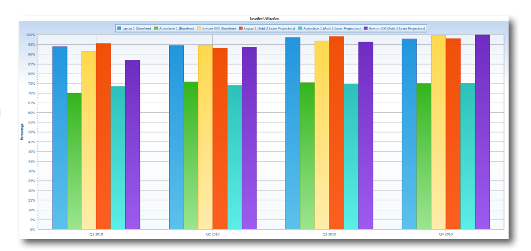
Comparative Scenarios: Equipment Utilization by Quarter